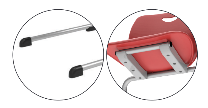
Cantilever chairs include protective glide covers and protective plastic guards to protect surfaces from impact and scratches.