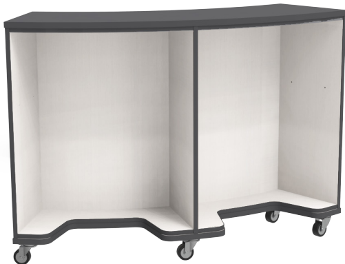
WSC1110-624222-AC Front View