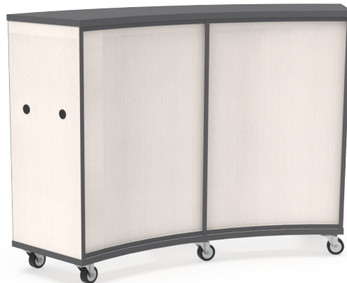
WSC1110-624222-AC Back View