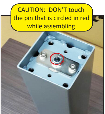
V042721 subject to change.