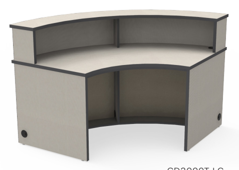
CD3000T-LG Unit shown in Premium finish (Shown with optional different colored edge banding)