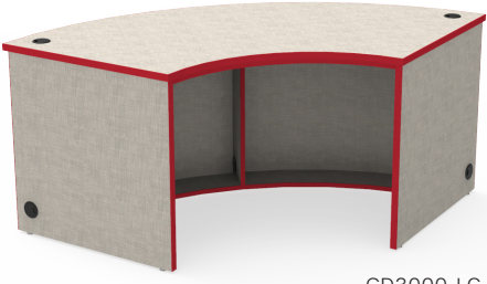
CD3000-LG Unit shown in Premium finish (Shown with optional different colored edge banding)