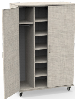
SS5020-4872-5AC Shown in premium finish

2 Fixed Shelves, 4 Adjustable Shelves, 1 Vertical Divider, 1 Wardrobe w/Garment Rod, Full Height Double Doors, Vertical Wardrobe Locks, Casters