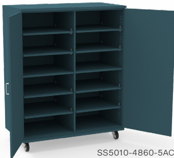
SS5010-4860-5AC Shown in premium finish

2 Fixed Shelves, 8 Adjustable Shelves, 1 Vertical Divider, Full Height Double Doors, Vertical Wardrobe Locks, Casters