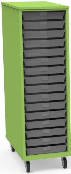
SSC0972-0AC Shown in premium finish