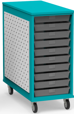
SSC0948-0AC-PB Shown in premium finish