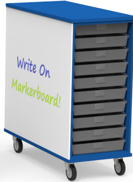
SSC0948-0AC-SB Shown in premium finish