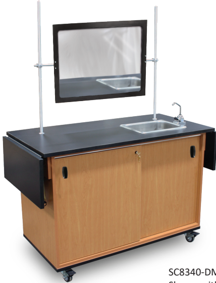
SC8340-DMSKHW-AC Shown with optional recessed pull