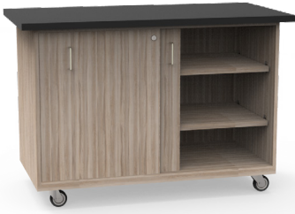
SC8340-AC Shown in Premium finish